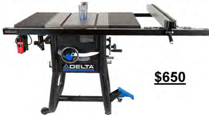
Table Saw for Set Construction

There are some items that are over and above our budget. Please visit our Wishlist Table in the lobby and give what you can!